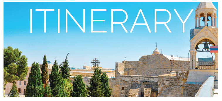
March 3 & 4 – Depart the USA & Arrive in the Holy Land Your pilgrimage begins as you depart the USA on an overnight flight. Once you arrive, you will be welcomed at the Tel Aviv airport by our representative and transferred to your hotel to enjoy dinner and overnight.