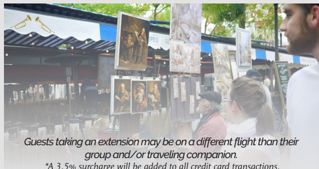
Guests taking an extension may be on a different flight than their group and/or traveling companion.

After checking out of your hotel, visit Montmartre, long known as the city’s premier artist’s enclave. During the mid to late 1800s, artists also began calling Montmartre home. Pissarro and Jongkind were two of the first to live there, followed by other notable artists. For easy access to Montmartre, hop aboard the funicular railroad that ascends the hill. Montmartre’s most recognizable landmark is the Basilica du Sacré-Coeur, constructed from 1876 to 1912. The white dome of this Roman Catholic basilica sits at the highest point in the city. You’ll then board the ship in Paris for your Paris & Normandy cruise. (B, D)